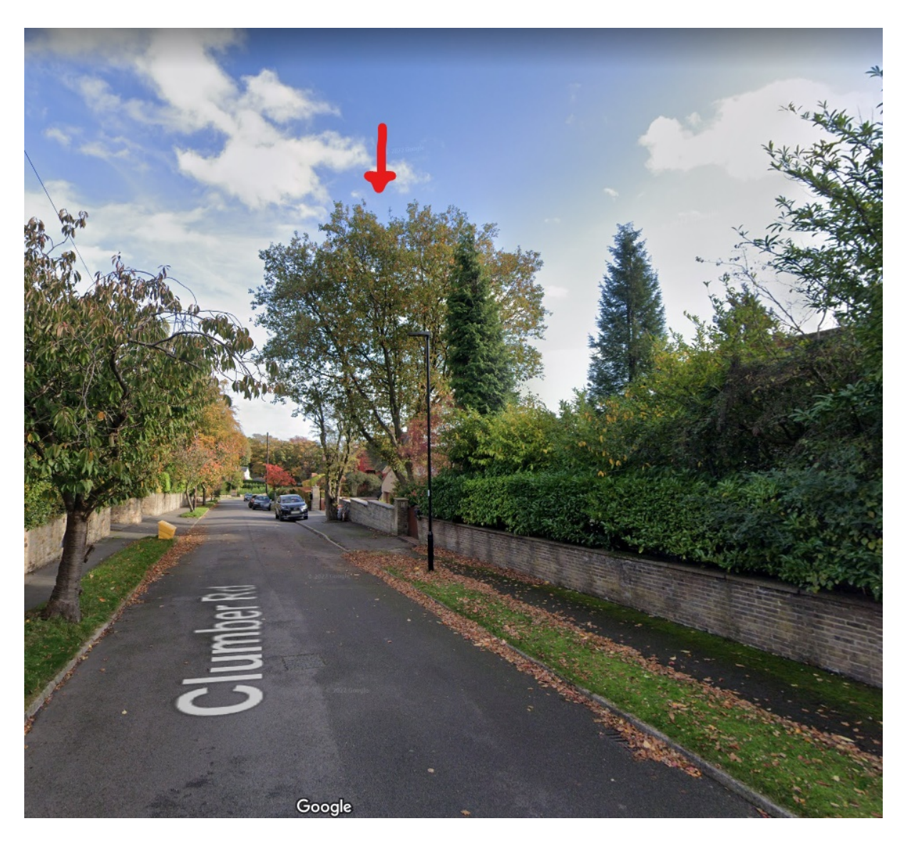
Image of tree taken from Google Streetview looking east along Clumber Road.